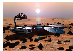
Beagle 2 on the surface of Mars