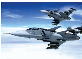
The JAS39 Gripen Fighter Aircraft