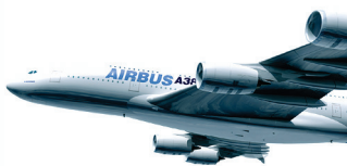
Airbus A380 Aircraft