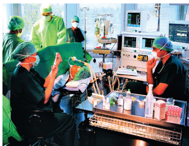
Patient Monitoring and Anaesthesia