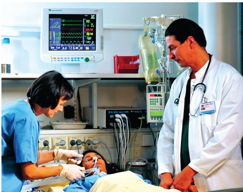
Critical Care Monitor in Use