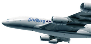
Airbus A380 Aircraft