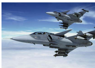
The JAS39 Gripen Fighter Aircraft