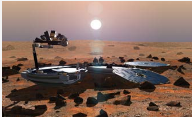
Beagle 2 on the surface of Mars

A different kind of project altogether, Beagle 2, was a UK-led Mars lander, intended to carry out a range of experiments to investigate whether life has ever existed on Mars. It would be launched as part of the larger European Space Agency Mars Express mission. Beagle 2 was being developed by Astrium on behalf of the Open University, who were leading the academic investigations in the quest.